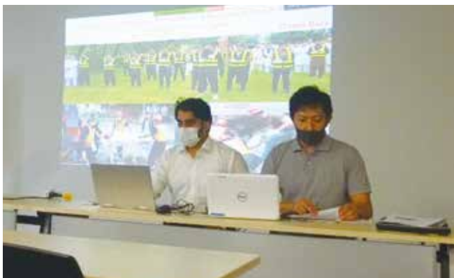
A scene from a training session in Kyoto Keizai Center

In the future, we would like to continue searching for the ideal way of providing support during times of disaster, to prepare for such occurrences, and to improve the overall support system.