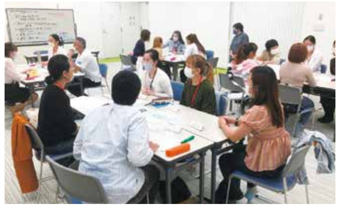
A scene from the Japanese language support volunteer training course in Miyazu City

Our center will continue to work in that direction along with Kyoto Prefecture.