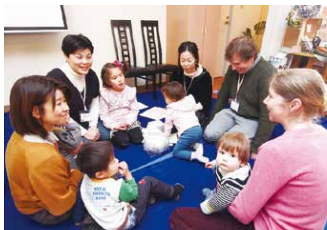
A scene from the playgroup "Ichigo Ichie"

To any international residents or Japanese people who want to help support international residents, please join us! We hope we can help to create a community where international residents and Japanese people can live together in harmony.